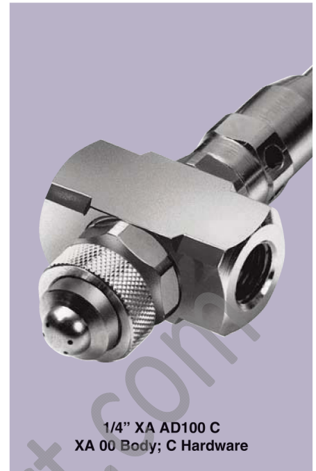
1/4" XA AD100 C XA 00 Body; C Hardware

Dimensions are approximate. Check with BETE for critical dimension applications.