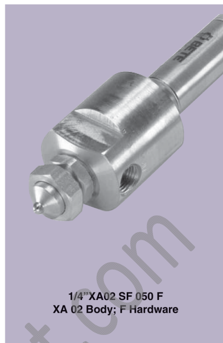
1/4" XA02 SF 050 F XA 02 Body; F Hardware

Dimensions are approximate. Check with BETE for critical dimension applications.