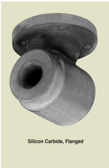
Silicon Carbide, Flanged