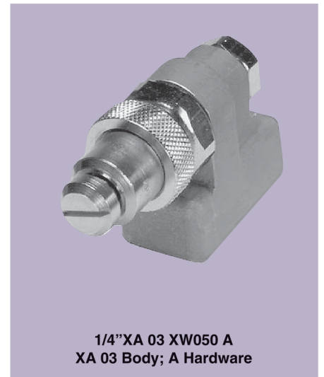
1/4"XA 03 XW050 A XA 03 Body; A Hardware