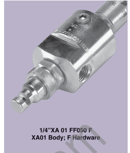
1/4"XA 01 FF050 F XA01 Body; F Hardware